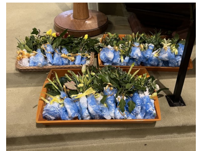
Posies ready to for the Sunday Club to distribute to the congregation

March to celebrate the women who have nurtured us throughout our lives and consider ways in which God cares for us like a mother. Posies made by members of the congregation were happily distributed by members of the Sunday Club.