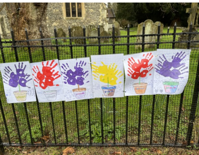
St Mary's School Year 3 used hand prints to make colourful pictures for the Hope Railings

In the 16th century, Mothering Sunday, the 4th Sunday in Lent, was less about mothers and more about church. Back then, people would make a journey to their 'mother' church once a year. The service which took place at the 'mother' church symbolised the coming together of families. The 'family' of St Mary's came together on Sunday 10th