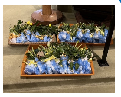
Posies ready to for the Sunday Club to distribute to the congregation

'mother' church symbolised the coming together of families. The 'family' of St Mary's came together on Sunday 10th